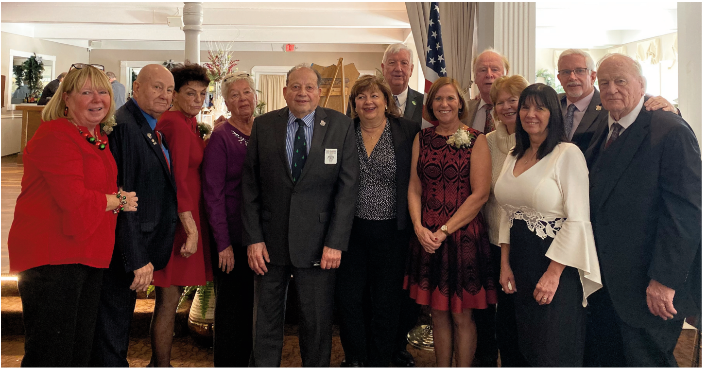
Partying on the Jersey Shore 12/3/19