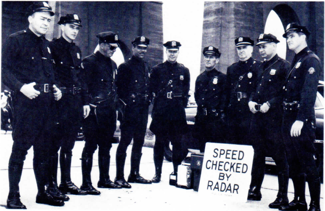
Road Warriors 1955